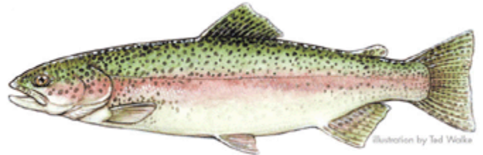
Illustration by Ted Walker

The brown trout makes its way down both the Loyalhanna and Conemaugh most likely from excellent trout fishing feeder headwater streams in the Ligonier and Johnstown vicinities, when high water occurs. The brown trout, like all trout, require an active insect presence for survival. Also, trout in general are coldwater fish, but brown and tiger trout are able to tolerate warmer water temperatures, where as the brook trout cannot. Brown trout are early morning and late evening feeders that hit hard, and are the most aggressive of western Pennsylvania trout species. The brown trout typically caught in either lake exceeds fourteen inches in length. Smaller trout that make their way down into the lake have the risk of becoming prey for predatory fish such as musky and northern pike. Tiger trout, a hybrid like the tiger musky, have been caught on a more consistent basis in both lakes. Tiger trout are also sterile, with no reproductive capabilities and possess a quicker growth