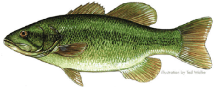
Illustration by Ted Walker

up near the dam site to challenge large bottom feeders, trolling the shallow headwater entrance for musky that roam shallow depths for feeding purposes. If trolling, be sure to stay in the channel (twenty yards out from shoreline) because the headwaters have developed into more of a canoe/ small fishing boat area. Recommended uses for musky are jigs and large minnows/ shiners. If a musky follows in your lure, but does not bite, do not give up hope. Options are changing the lure and trying again, or using the same lure, but reeling it by the musky at a different pace.