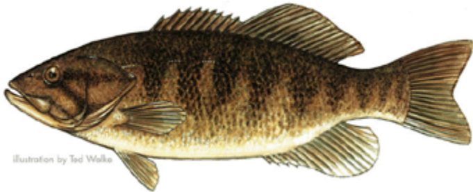
Illustration by Ted Walker

distinguishable from the musky because of its exotic stripes, and tendency to be of a stockier build. Tigers are result of natural breeding between musky and northern pike. These hybrids are sterile. Both musky and tiger musky prey upon other fish, including yellow perch, smaller trout, and small bass. A musky's appetite is so large that it pursues fish that are up to one fourth of its size. Typically, deeper pools are preferred by musky, but in the summer time they can also be landed in shallower waters.